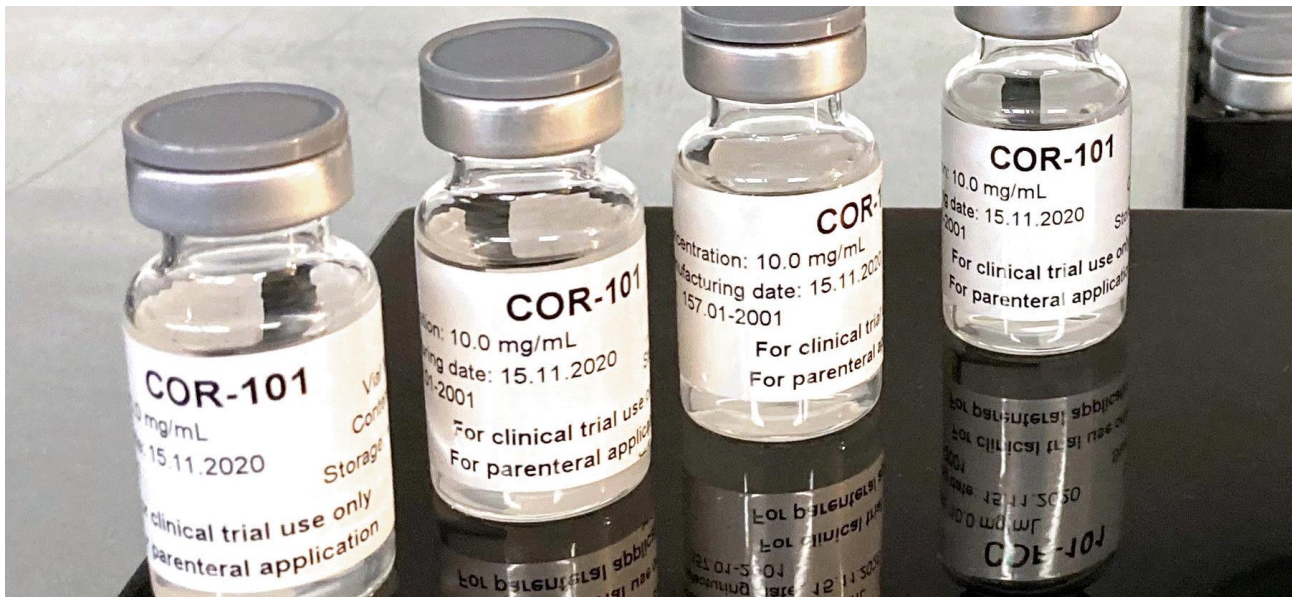
Image text: Doses of COR-101 ready for clinical testing (Photo: Holger Ziehr, Fraunhofer ITEM).